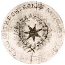
Original Seal, 1869